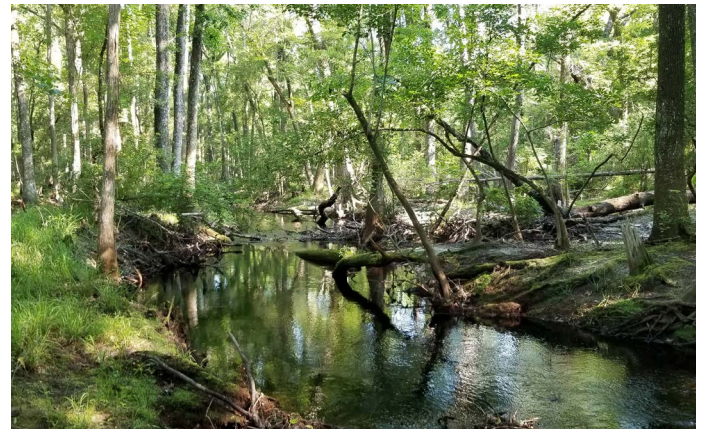
Santa Fe River - Bell Property

After a successful year, 2024 looks to build on these conservation successes with numerous projects across the County under contract or in the negotiation process. Thanks to Alachua County voters, the Alachua County Forever program is funded through 2032, allowing ACT to continue to partner on important conservation projects that will protect land along the Santa Fe River and throughout Alachua County.